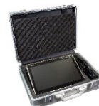
Transport case included